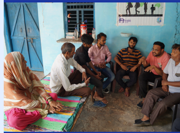
"Artisans trained on Quality, Innovation, and Efficiency"