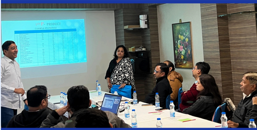
"Annual Producers Capacity Building training in Delhi"