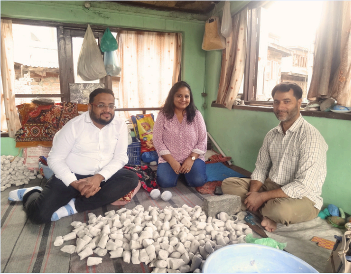
Staff visits to Kashmir