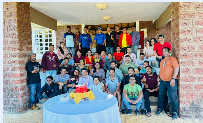
"Staff Picnic: A Day of Team Bonding and Fun Outdoors."