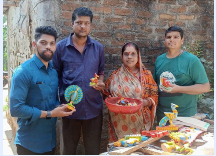
Staff visits to Odisha