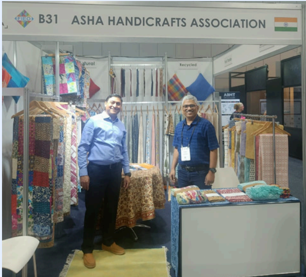
Global Sourcing, Australia