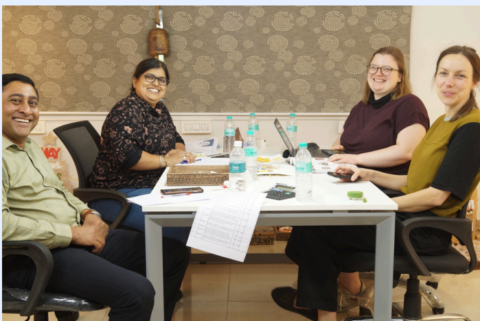
Buyer El Puente at Asha Office