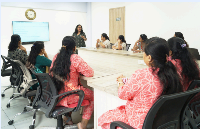
"Staff Training: Enhancing skills to boost performance and achieve organizational goals."